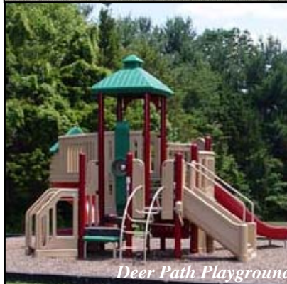
Deer Path Playground