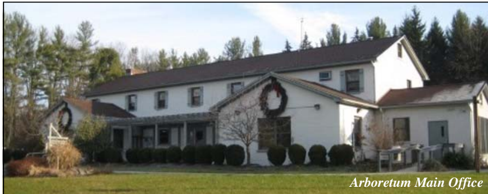
Arboretum Main Office