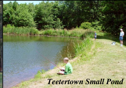
Teetertown Small Pond