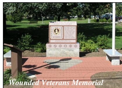
Wounded Veterans Memorial

No fee for reserved use of park by Flemington Borough (Park cleaned by Borough, w/in 2 hours after event)