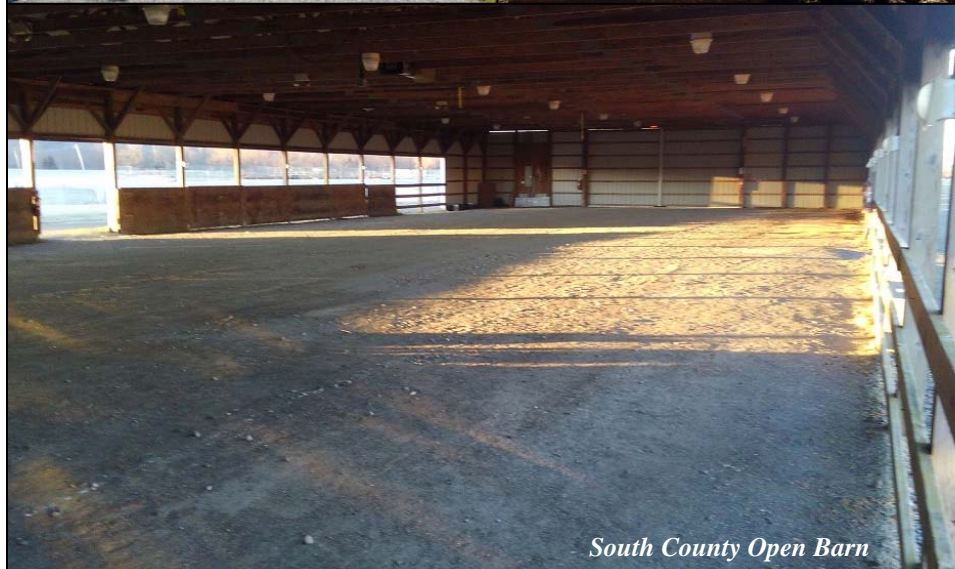
South County Open Barn