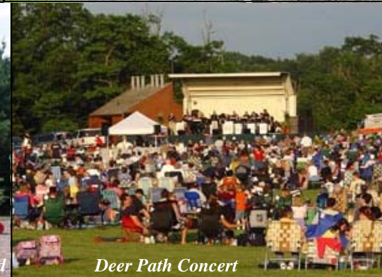
Deer Path Concert