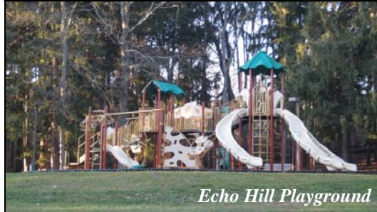
Echo Hill Playground