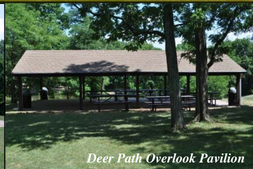
Deer Path Overlook Pavilion