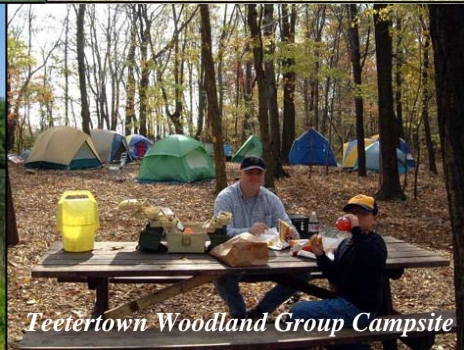
Teetertown Woodland Group Campsite