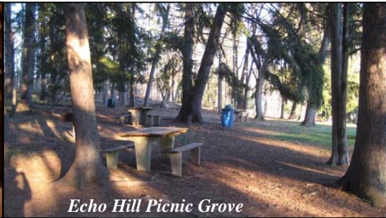
Echo Hill Picnic Grove