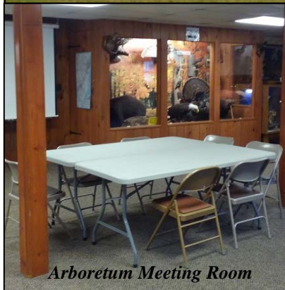
Arboretum Meeting Room