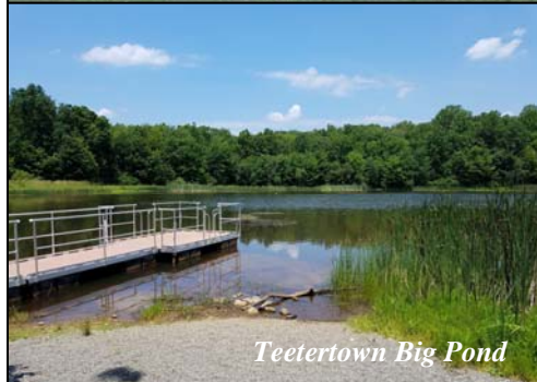
Teetertown Big Pond