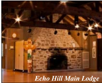
Echo Hill Main Lodge