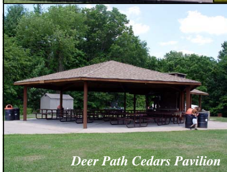
Deer Path Cedars Pavilion