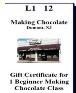
Prize Basket Label Sample Actual size (5" x 7")