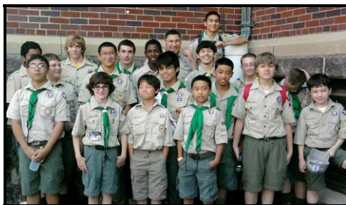
Our scouts before Summer Camp August 2011