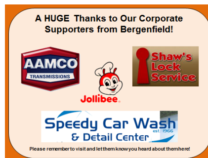
Slide Show Ad Sample