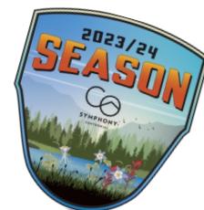
Denver Performing Arts Center Tickets