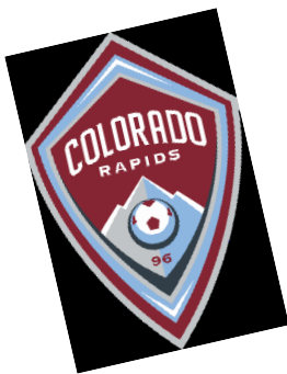
Home Soccer Game Tickets