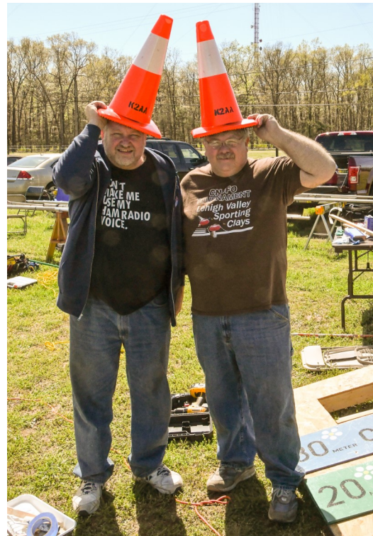
“Hamming” it up at the SJRA Trailer work party.