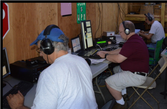
CW Ops in the SJRA Trailer