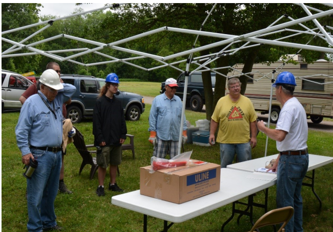
Safety Meeting Prior to Set-up.