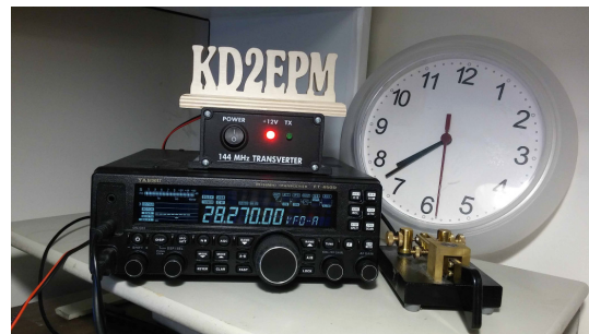
Figure. 1, KD2EPM's 2M SSB Station and Transverter.

If interested visit: http://transverters-store.com or contact Dom at: doms at hot-mail dot com.