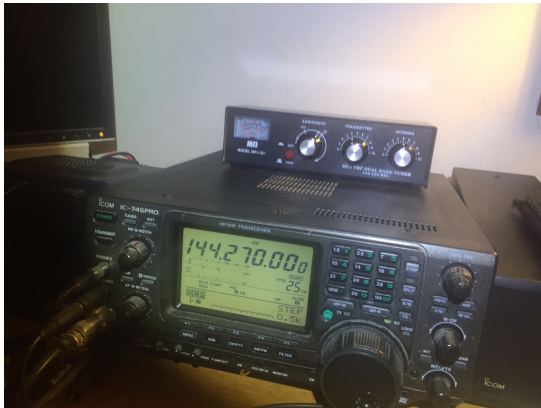
Figure 1, WY2J's 2M Antenna Tuner & ICOM 746PRO

SJRA community. The 2 meter SSB net has only been on the air three times and while it was specifically designed to minimize new major purchases it has triggered some experimentation and station upgrades. My contribution to this activity was adding a $90 new antenna tuner to fix the 1.8:1 SWR on my Diamond X200 FM band antenna. My 12 year old ICOM 746PRO has no tuner on 2 meters and the ALC rolls back the power for SWR above 1.5:1, in my case from 100 to 60 watts. I selected the MFJ921 manual tuner that works on 2 and 1.25 meters up to 300 watts PEP. Figure 1 shows the tuner on top of my 746PRO.