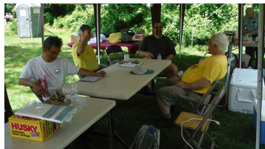
Operators Relaxing Between Their On-The-Air Activities