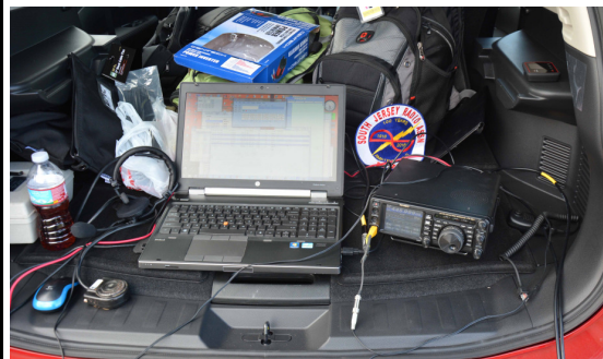
K2WB-R Operating Position