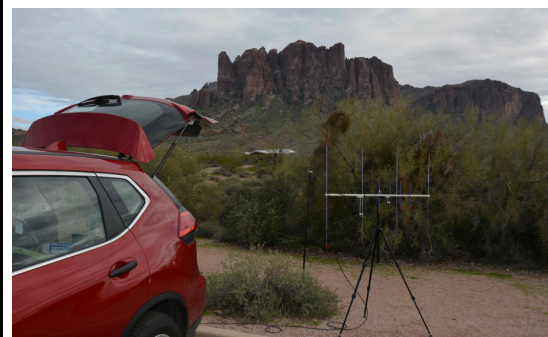
Antenna with Superstition Mountains in background