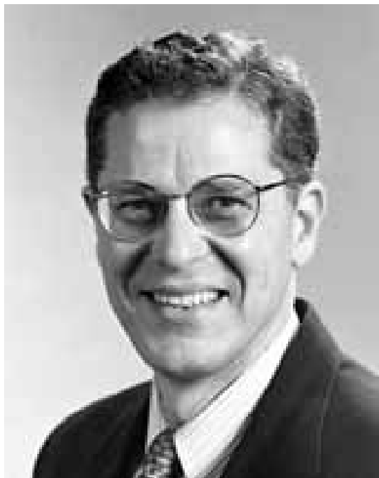
Joe Taylor, K1JT, is SJRA Guest Speaker

Princeton University Professor and Nobel Laureate Joseph H Taylor will be the honored guest speaker at the November meeting of the SJRA at the Gibson House on November 20. Professor Taylor, K1JT, is an active ham, has been a ham radio operator since his boyhood days in Cinnaminson, was formerly an SJRA member, and is an Honorary Lifetime Member of SJRA. In 1993 he and Russell Hulse were awarded the Nobel Prize in Physics for their discovery in 1975 of the first binary pulsar system. Professor Taylor also authored the ham radio