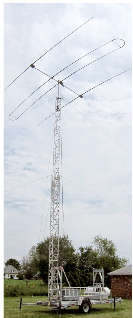
Figure 2 — K9CT's trailer tower, equipped with a properly guyed Aluma Tower and a SteppIR antenna providing 6 – 40 meter coverage.