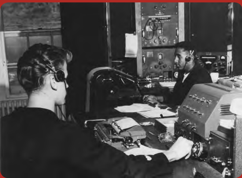
The position in the background is most likely the guard position, where an operator monitors 500 KHz continuously for distress, while processing more traffic on a working frequency. The position in the foreground shows a transmitter control device (the panel with the toggle switches and dial telephone pad) used to control the mode and frequency of the selected transmitter, and a device called a "whetstone machine," used with the automatic keying machine.

Those same regulations also require that there be no charge for any distress-related communications.