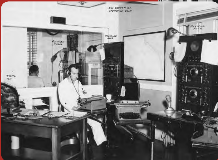
The operations room at USCG Radio Station Long Beach (left).

The radio operator monitors the international distress and calling frequency and operates the TWPL, which connected the station to the district headquarters. Through the glass is another radio operator monitoring another distress frequency and making all voice broadcasts.