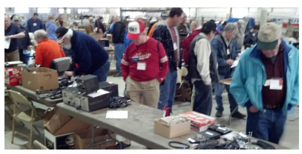
Shopping for bargins

tion numbers) please email: -Bruce Wood. WAØRIM wa0rim@arrl.org