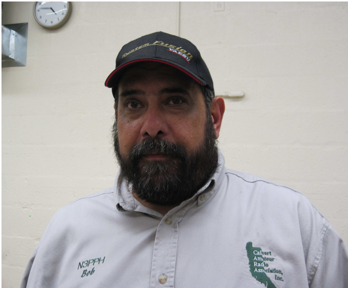
SANTA CLAUS — NOT!