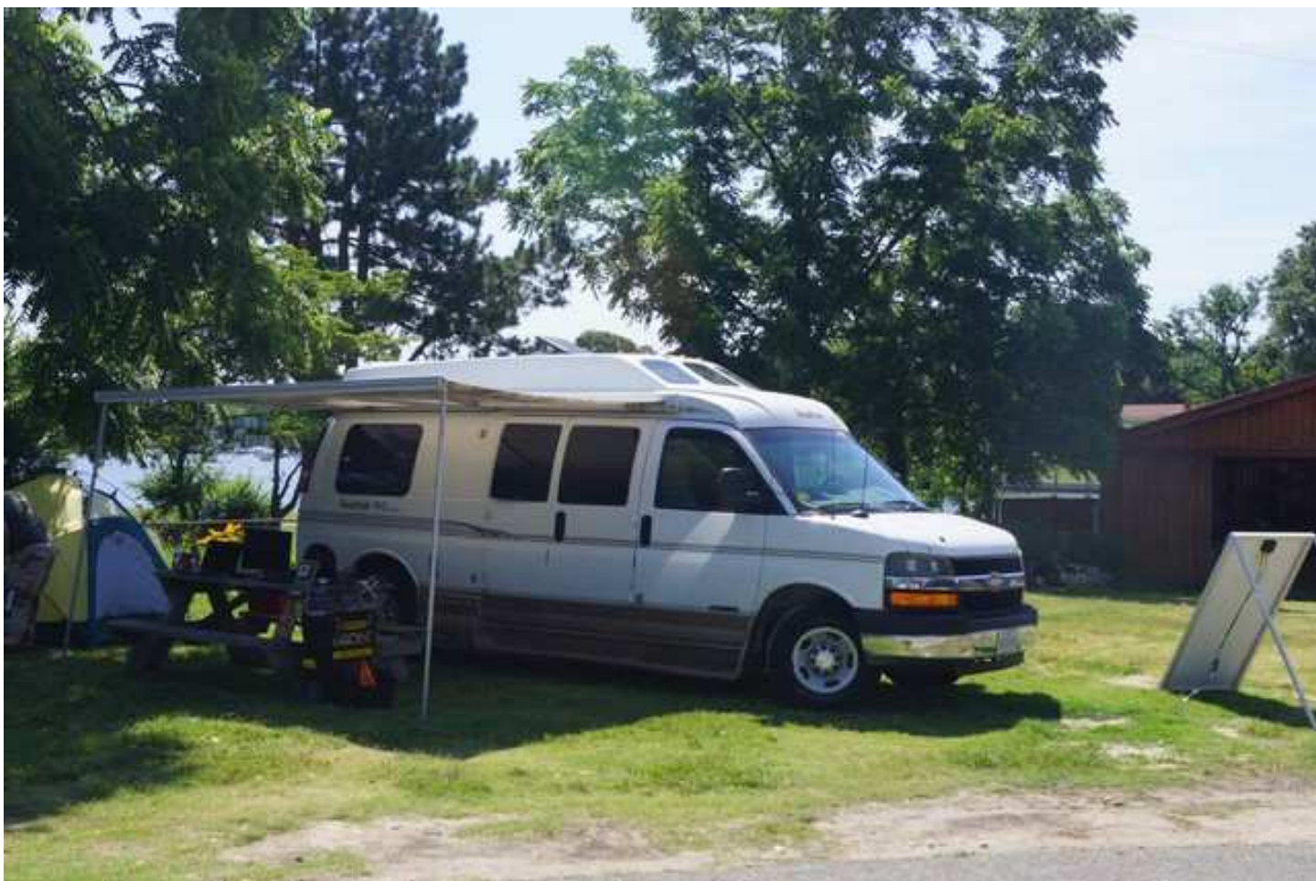
Mobile operating at its finest, complete with solar power, courtesy of Dave, KB3RAN.