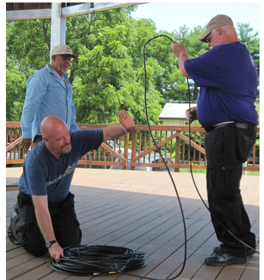
The party's over!