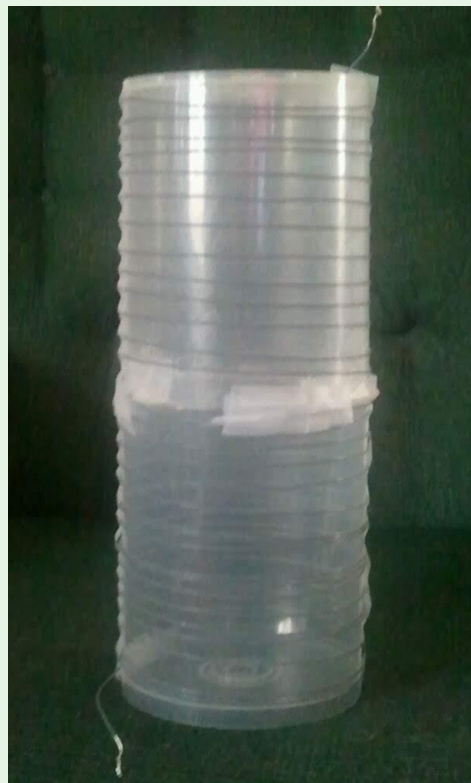
My crude "extra loading coil" (wound on CD boxes) that allows using the wire on 160 meters.

Although I have made hundreds of contacts on the 80 meter and 160 meter bands, I have made many thousands of contacts on the higher bands. (ie; the "juicy DX bands"!)