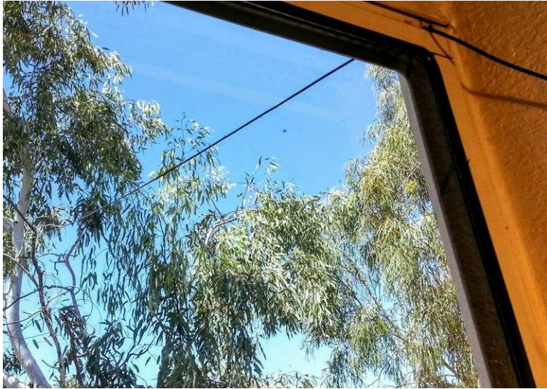
The 20-foot wire, exiting the window and out to the tree.

headphone, paddle, and speaker cables etc. but no actual “ground.”)