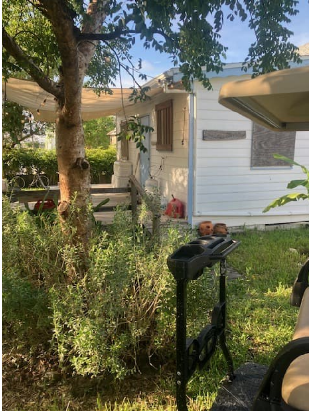
Last location of beacon