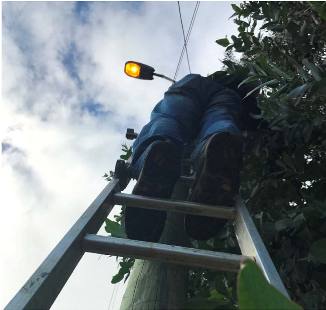
We are checking the lamps outside of the bungalow

The only one way was is to try different types of antennas. It was some hope that the loops will work better in these noisy conditions and we made full-wave loops for 40 and 80 meter bands to try it as the receiving antennas. It was a big challenge to setting up 80 meters delta-loop, but Vlad RK8A, our SOTA-man, has climbed to the tall hill behind our QTH and set it between the high trees. It was much easier to install 40 meter one because of its smaller size, but also took some time. Looking ahead, I'll say that it brought good results and reduce the noise level on 40 and 80 meters.