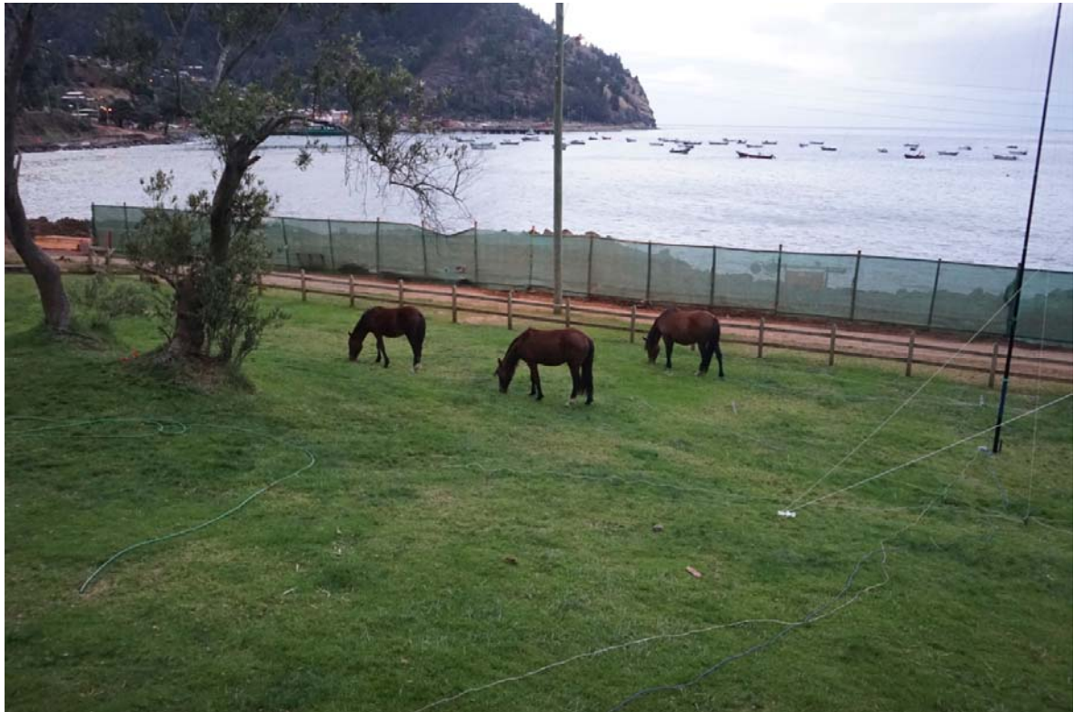
Horses near our antenna field

we have lost one more pole. Something needed to be done and we build protective shields around our poles using various items which we found in our garden.