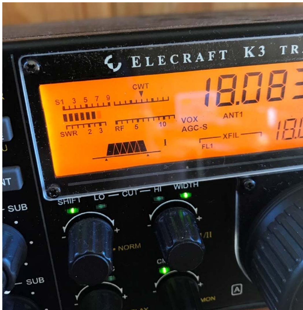
S-7 QRN-level on 17 meters band

We were ready to setting down our position and change the current QTH, but with great regret we found that the QRN-levels on central and western sides of the settlement are even higher then we have. The best way out was is to find a good place outside of the settlement and set up portable radio camp. Off course, we were not ready absolutely for the portable activity and it was necessary to find tents, generator, fuel tanks and other equipment.