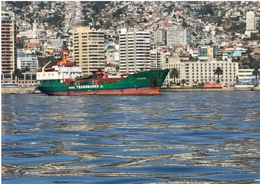
“Antonio” ship carry cargo and passengers to Robinson Crusoe isl.

The voyage to the island took 55 hours and was very exhausting due to rough sea. The ship anchored in Cumberland bay at around 15-00, 17-th of March. Here it is – the legendary Robinson Crusoe Island!