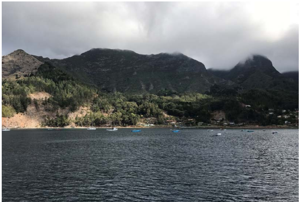
Cumberland Bay (View from North)

The voyage to the island took 55 hours and was very exhausting due to rough sea. The ship anchored in Cumberland bay at around 15-00, 17-th of March. Here it is – the legendary Robinson Crusoe Island!