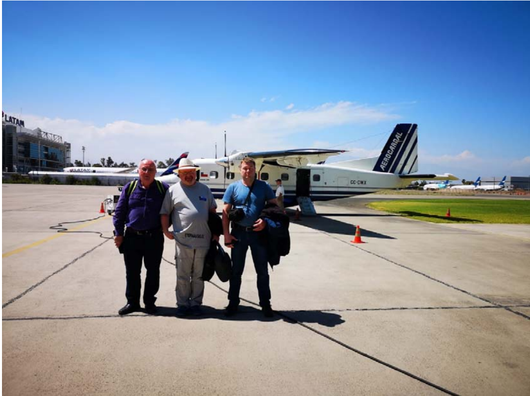
SP6EQZ, RL5F, RW9JZ boarding the plane to Robinson Crusoe

nice architecture, lots of green parks and good peoples. Everything was a little complicated by the fact that almost no one spoke English, even a bit, and some simplest things caused difficulties.