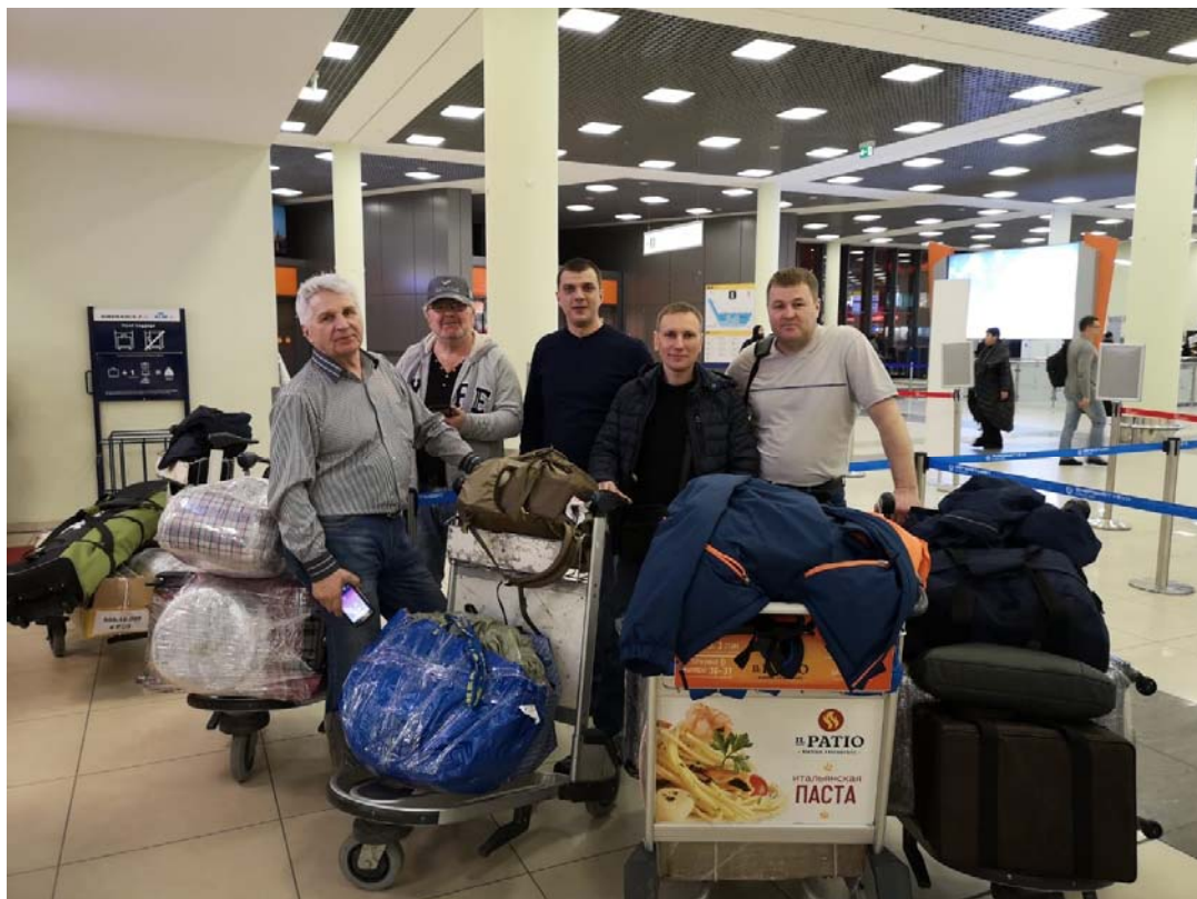
XR0ZRC team before leaving from Moscow to Santiago