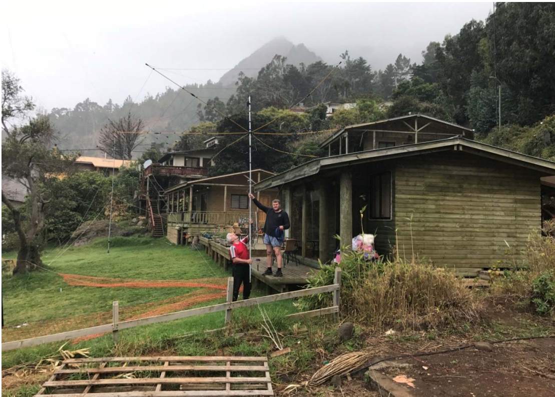
RK8A and RW9JZ moving Folding ant. (Spiderbeam on the background)