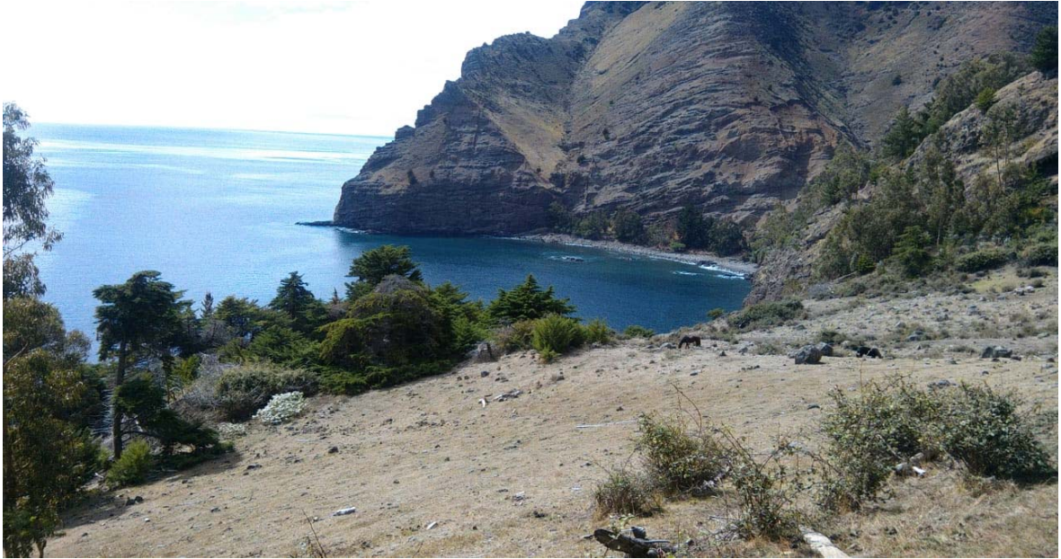
Beautiful bay to the west from the settlement