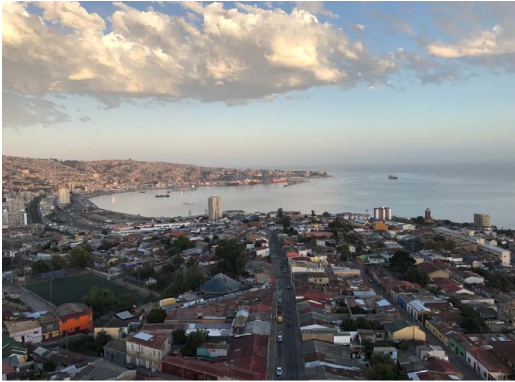
Valparaiso city – the biggest port in Chile